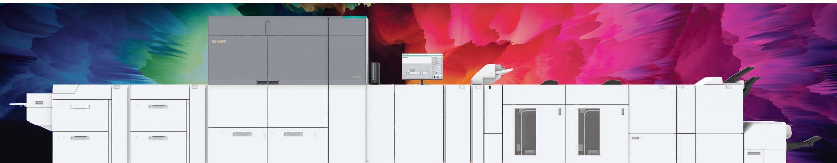
The BP-1200S Color Press Series shown in a full configuration.

The Color Press Series from Sharp delivers unrivaled capabilities to digital printing. With stunning 4-color imaging that can be augmented with printing of up to 6 specialty colors in one pass, the Sharp Color Press Series can make your print jobs virtually come to life. Create a variety of metallic effects with Silver and Gold underlay or add bright Pink for an innovative, eye-catching design.